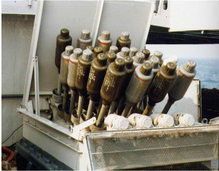
Above: The Mk 11 launcher with 24 “Hedgehogs” also called 7.2-inch Projector Charges on a Predator-class corvette of the Dutch Navy. Fuze caps are installed. Hedgehogs only detonated when the fuse made contact with the submarine.