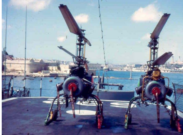
Above: A pair of QH-50C drones aboard USS ALLEN M. SUMNER (DD-692).