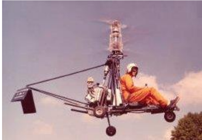
Above: The XRON-1 Rotocycle in flight.

Meanwhile, Gyrodyne built another XRON-1 with a Solar gas turbine of 55 hp. This helicopter had 20-foot diameter rotors and weighed 617 pounds. Gyrodyne tested all three versions of the XRON-1 extensively during 1956 and 1957. Gyrodyne thought the Porsche engine version was the better of the three designs and requested a 72 hp version of the engine from Porsche specifically for the XRON-1.