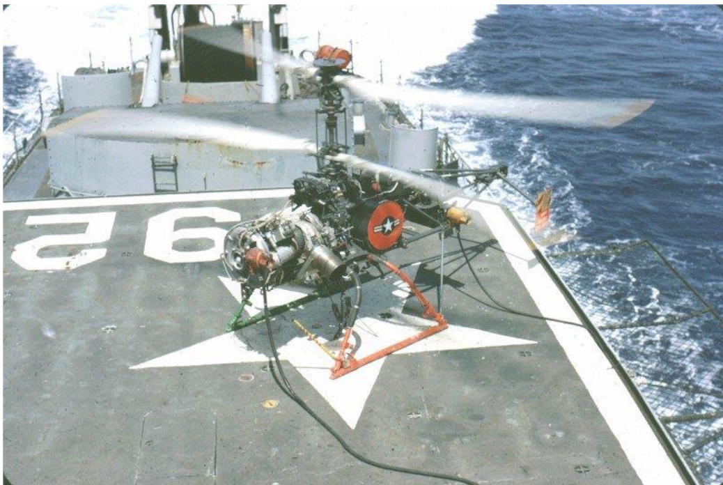
Below: A QH-50D aboard SUMNER just after startup and before the electrical cables were unplugged.