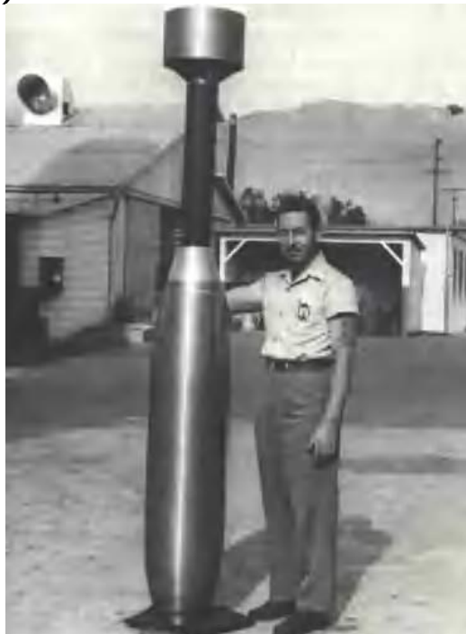
Below: The RUR-4A 12.75-inch Weapon ALPHA anti-submarine projectile at Naval Ordnance Station, China Lake about 1950.