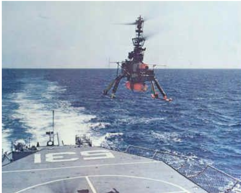
Above: A QH-50A launches from USS HAZELWOOD (DD-531) on 12 September 1960.

drone helicopter that could carry a Mk 43 torpedo or Mk 17 nuclear depth charge. The QH-50A used the modified Porsche 72 hp engine. Improvements to the "A" model were implemented into the improved QH-50B variant. During tests, the engine of the QH-50 was changed to the T50-BO-8A turbine made by Boeing Company that used JP-5 fuel (considered less volatile and safer for shipboard use).