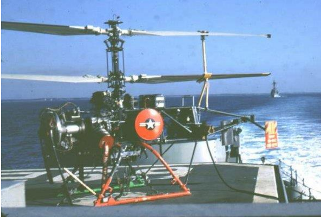
Above: USS ALLEN M. SUMNER (DD-692) with a QH-50C DASH on the helo deck after being rolled out of its hangar. Both electrical cables are attached.