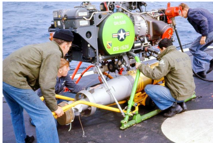
Below: Loading a Mk 44 torpedo onto the Mk 8 bomb rack of an OH-50D. The brown object attached to the rear of the torpedo by the hand of the sailor moving the yellow torpedo cradle is the pack for the retarding parachute to slow the torpedo's water entry speed.

Operational concept. The DASH was designed to extend the range of the ship to strike at enemy submarines when they were detected. Either one or two Mk 44 torpedoes were loaded onto the DASH. The DASH was moved to the helicopter deck from the hangar and two cables were hooked up. One cable provided starting power for the gas turbine engine; the other cable provided power for the onboard electronics and gyro stabilization system.