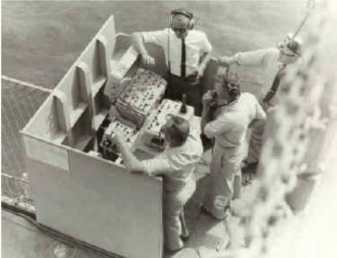
Above: The DASH officer's deck control station on the edge of the flight deck. A Gyrodyne tech rep is assisting the officers.

The DASH officer applied full power and set the altitude. He applied up collective on the rotors and released the hold-down cable that restrained the aircraft. At a pre-selected altitude set by the control station, the DASH leveled off and assumed a pre-determined heading towards the target at 92 mph. Operational radius of the QH-50C/D was between 28 and 40 nautical miles.